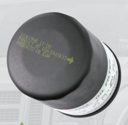
AMSOIL Oil Filters feature a reference arrow to aid in proper installation. Once the filter is finger tight, it is easy to gauge the additional .75 to 1.25 turns required to ensure a good fit. Over-tightening can lead to leakage.