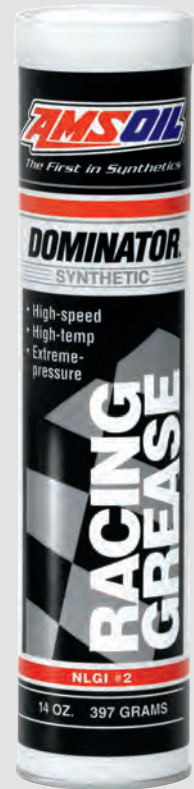
NLGI #2 GC-LB

DOMINATOR Racing Grease contains a robust package of oxidation inhibitors, helping prevent grease breakdown and component surface damage. Its excellent adhesion and cohesion properties allow it to resist water washout during operation in wet conditions. A premium blend of corrosion inhibitors further protects against corrosion formation.